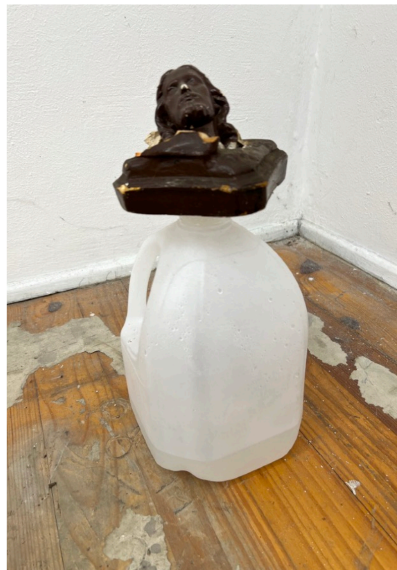
Brandie, 2024 Mixed media, artist's frame 11 x 9 in (framed) $300