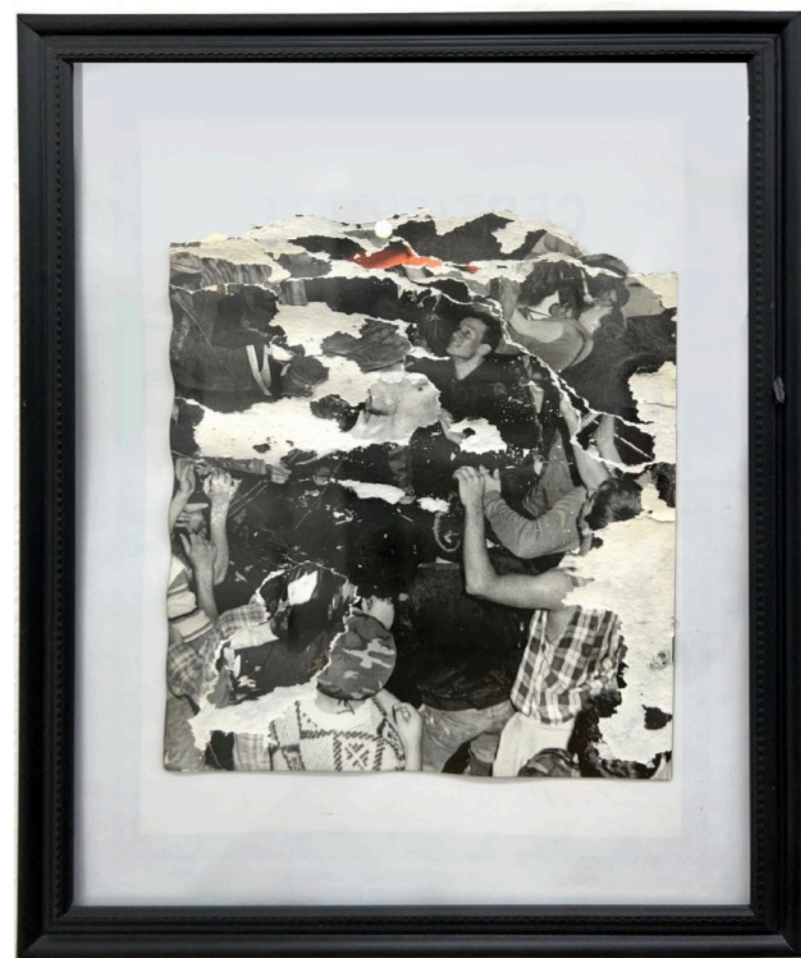
Rat King, 2024 Paint on canvas, mixed media 4 x 3 ft SOLD